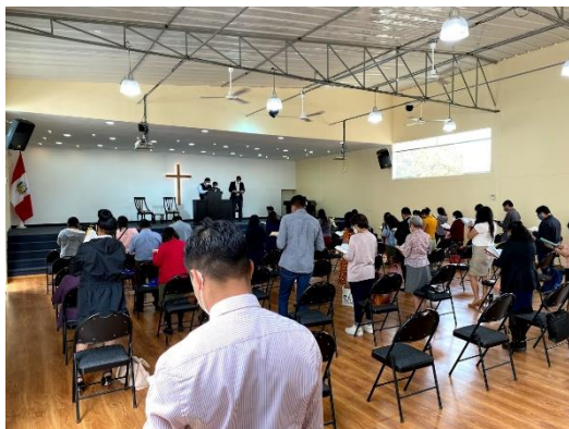
Sunday Service No. 2