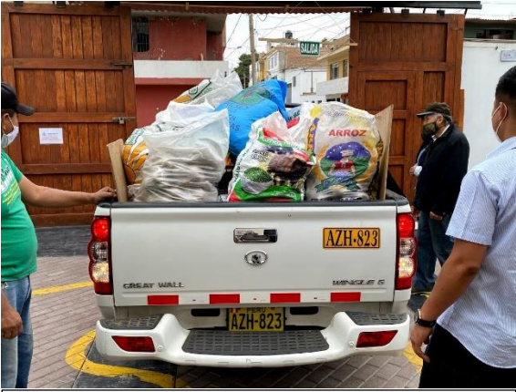
First of three trucks full of groceries