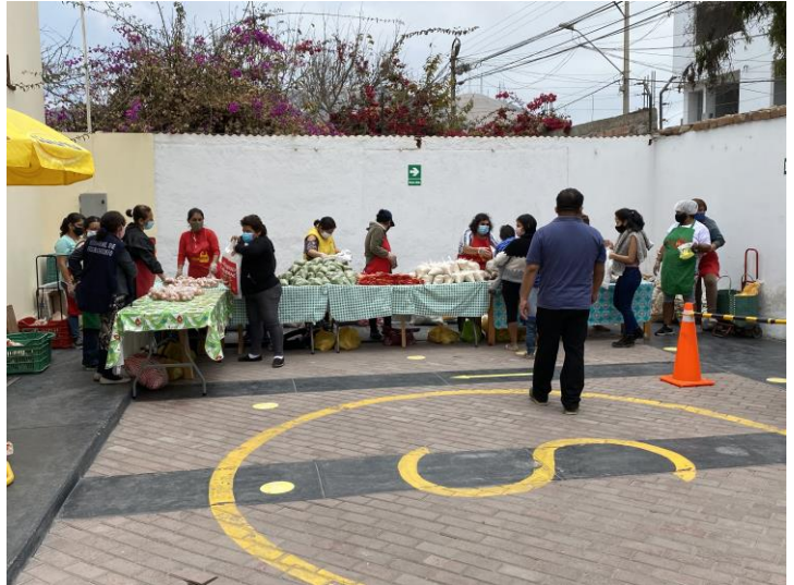
Most of these people have been reached during this time.