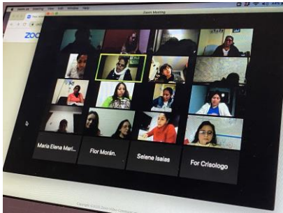
Virtual Bible study