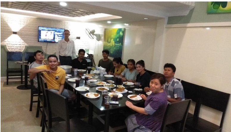
My Saturday evening ministry with the university students