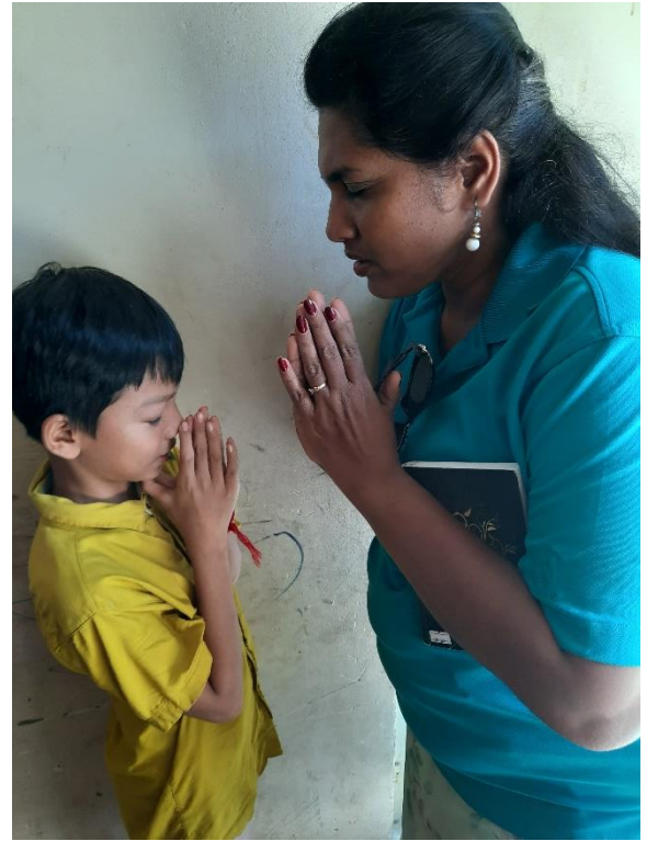
My wife praying with a Sunday school boy