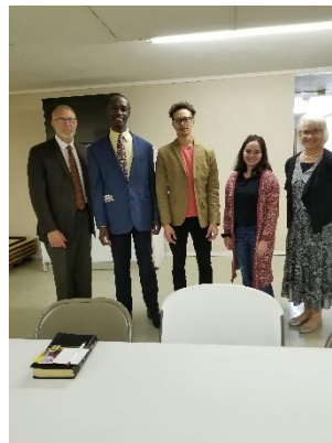
First-time visitors and missionaries