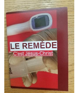
Left: French church tract Right: French COVID-19 tract