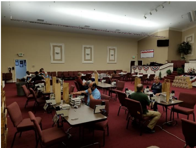
Compiling John & Romans