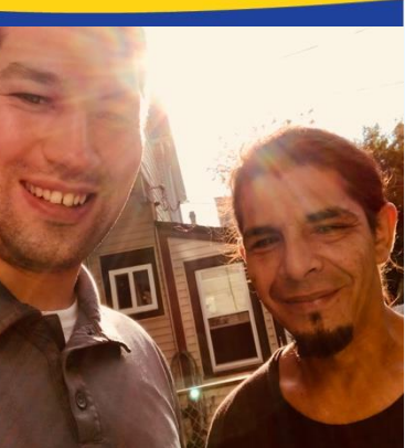
Geraldo trusted in Christ to be saved!