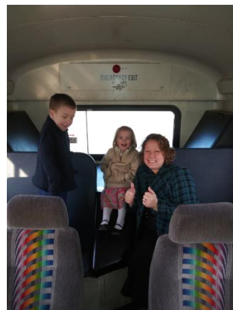
Bus Ministry at Lighthouse Baptist Church