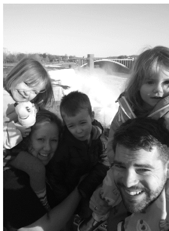
Niagara Falls on our way home—we all made it in one picture!