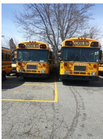
New buses we were able to pick up for Lighthouse Baptist Church