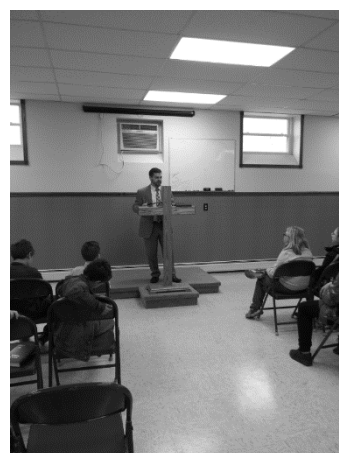
Teaching Sunday school to young boys and girls