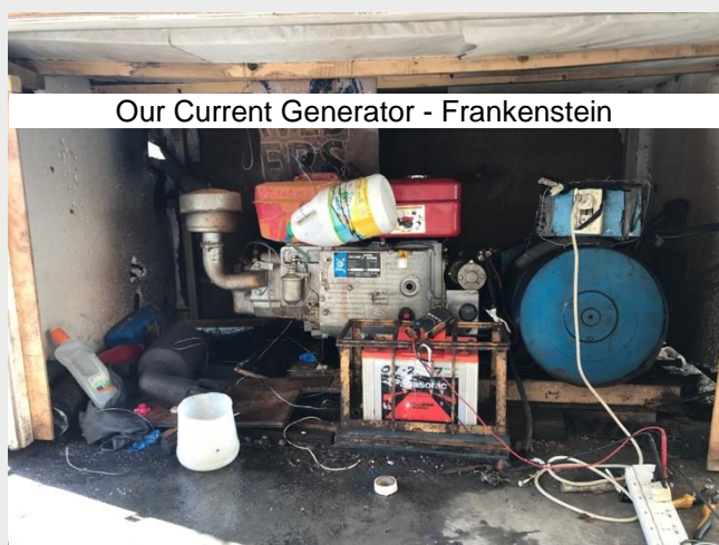
Our Current Generator - Frankenstein