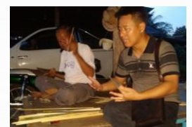
Our landlord hearing the Gospel