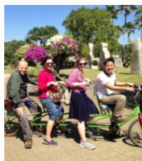
Our new neighbors