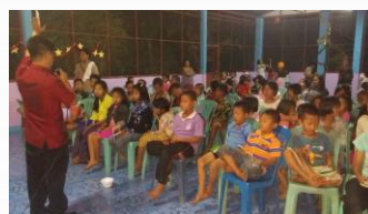
Last year's Christmas program