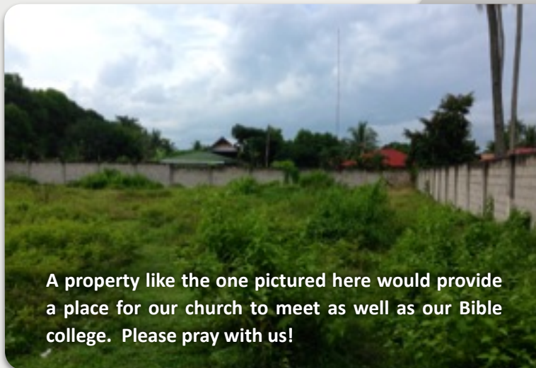
A property like the one pictured here would provide a place for our church to meet as well as our Bible college. Please pray with us!