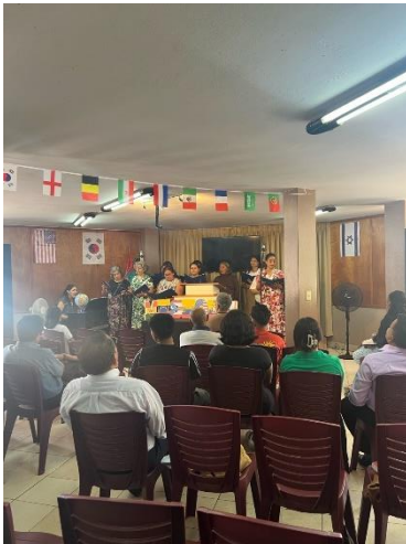
The ladies did a wonderful job singing during our Missions Conference!