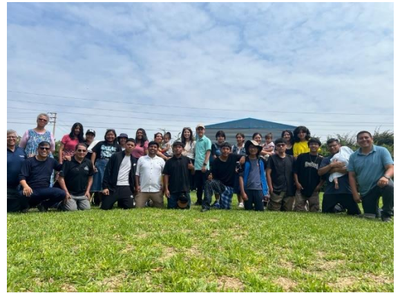
These amazing people from our church attended or served in Teen Camp!