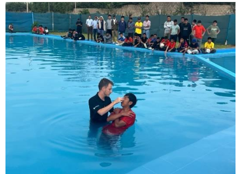
I was grateful to baptize two of our young people at Teen Camp.