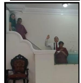
Serving in a Rehab