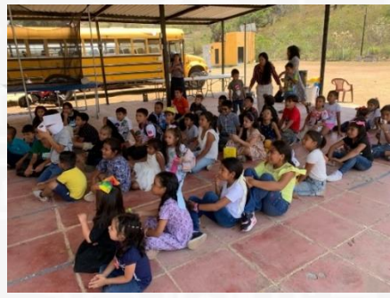
The children enjoyed the teaching of the Bible.