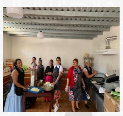
Our ladies did a great job with the cooking.