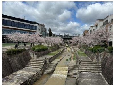
Beautiful Japanese cherry blossoms