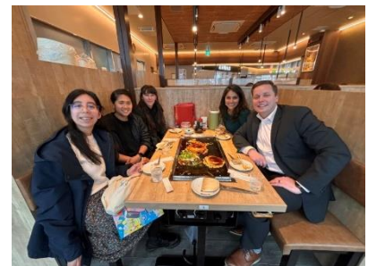
Group of young ladies from Pacific Baptist Church in Long Beach, California, visiting us in Japan