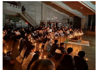
Candlelight Service at Youth Camp