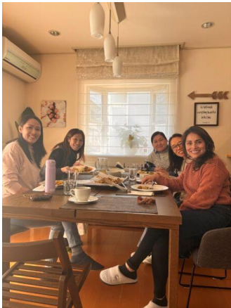
Local mothers gathered at our home to practice cooking