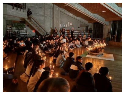
Candlelight Service at Youth Camp