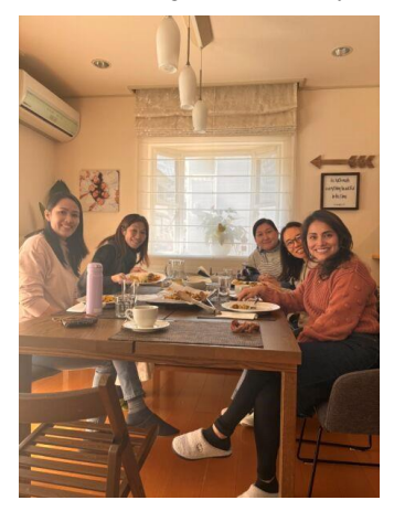
Local mothers gathered at our home to practice cooking