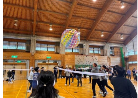
Sports Tournament at Youth Camp