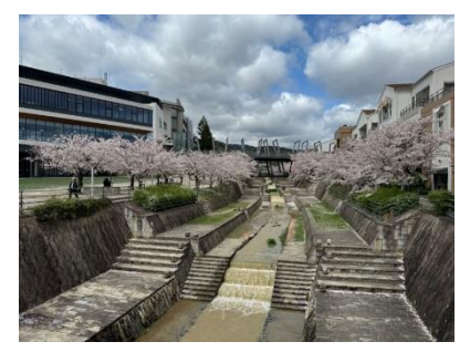
Beautiful Japanese cherry blossoms