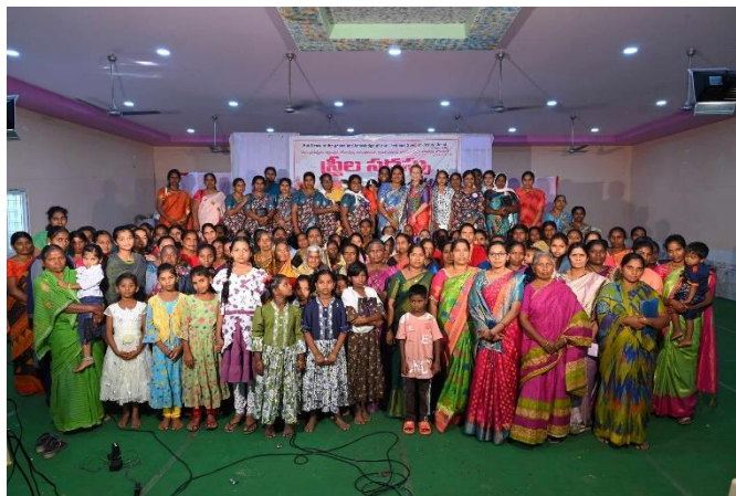
Ladies' Conference in India