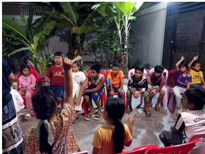
Outreach at Our House