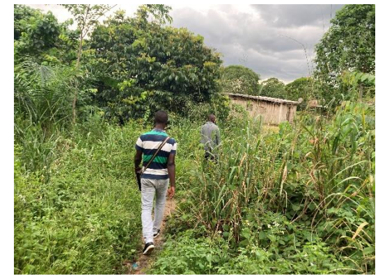
Soul Winning in Ntoum

The Lord Jesus Christ, through the Independent Fundamental Baptist Church of Gabon, has been training more soul winners, especially younger people for the ministry.