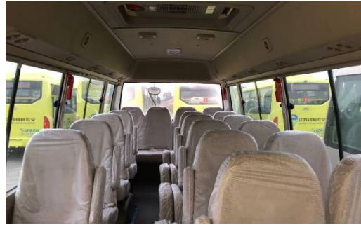
35-Seat Soul-Winning Bus to Purchase