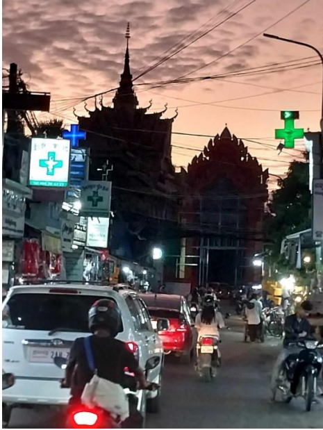
Night is truly falling in Cambodia!