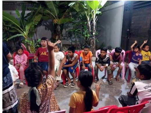
This is a village Bible Club. Actually, this was held on our house property. We moved to this location about two years ago, which happens to be about 30 minutes from the city of Phnom Penh and in a more rural area.