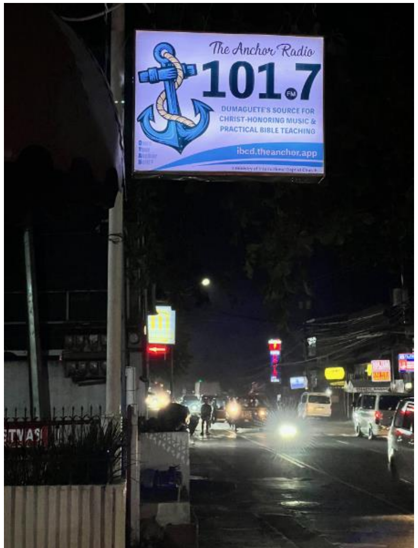
Street sign for 101.7 FM Dumaguete