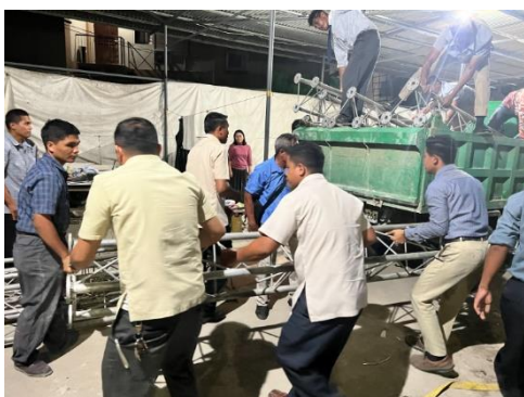
Our men unloading the radio-tower segments after a service