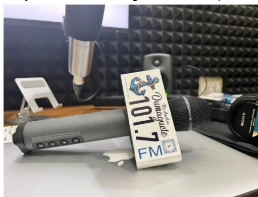
101.7 FM Dumaguete's on-the-street microphone