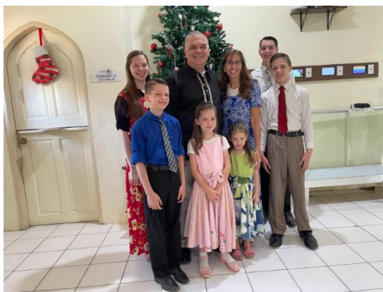
The DeMerville Family