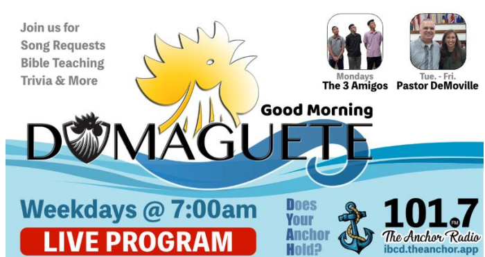
Our live weekday morning program on the radio