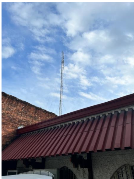
A view of our radio tower from the parking area