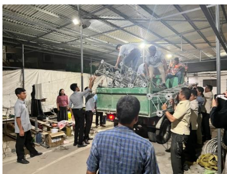
A pastor friend in Mindanao donated our tower to us; here it is being delivered after a service.