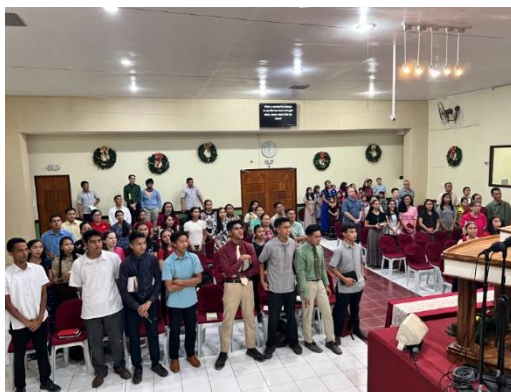
At our monthly prayer group for our missionaries