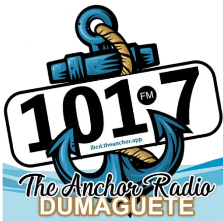
101.7 FM The Anchor Radio Dumaguete Sticker