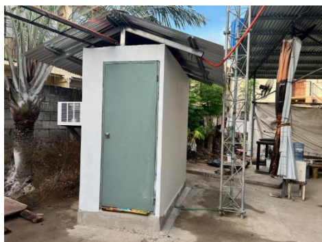
Our radio transmitter room when under construction