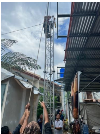
Erecting our radio tower