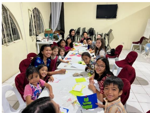
At our monthly prayer group for our missionaries, the children are working on items to send to our missionaries.