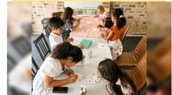
Sunday School in the Garage