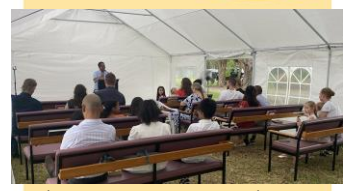
Christmas Eve Service in the Tent