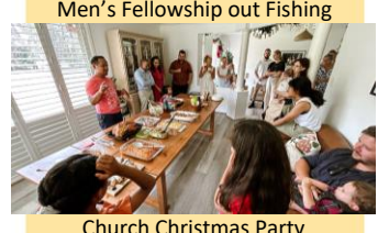
Church Christmas Party