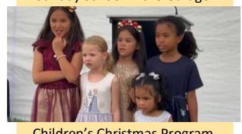
Children's Christmas Program