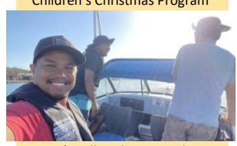
Men's Fellowship out Fishing