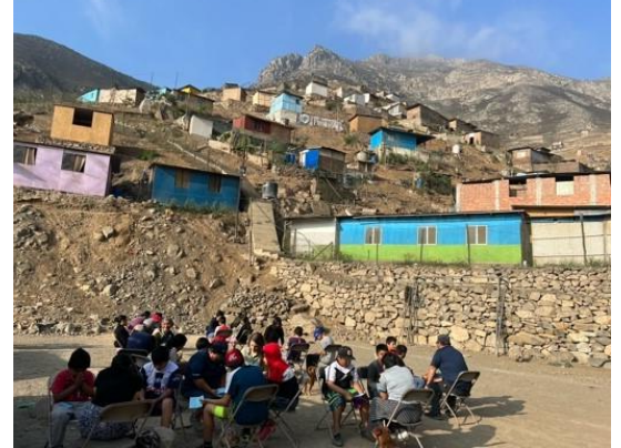
What a joy it was to share the Gospel with these people during our outreach event on one of our bus routes!