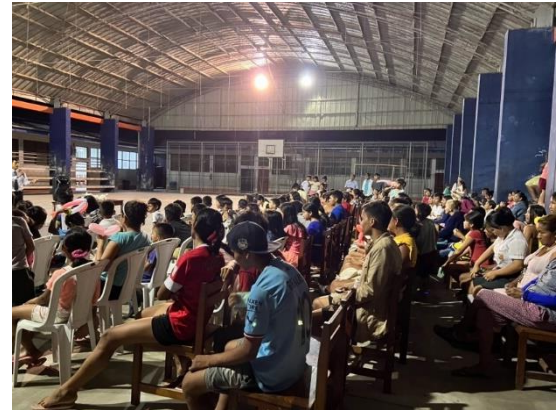
These people came for our Family Conference in Iquitos.