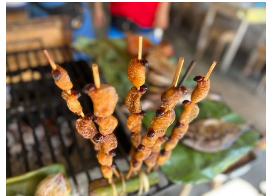
Right: Grilled grub worms anyone?