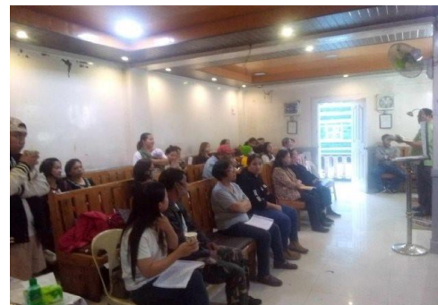
One of our preachers giving the Gospel at the funeral of one of our members

LOCAL CHURCHES MULTIPLYING LOCAL CHURCHES