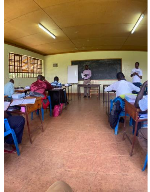
PPTA—one of the pastors is giving the lesson to the other pastors