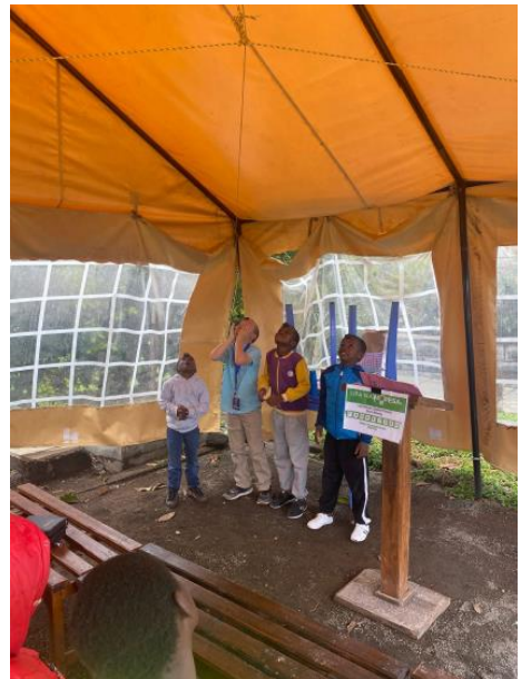
The boys playing the Oreo Game in Kids' Class