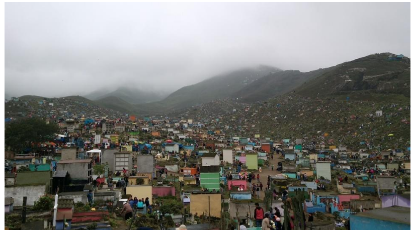
This is Nueva Esperanza, the cemetery we will be visiting again this year on November 1. Please pray for this day!