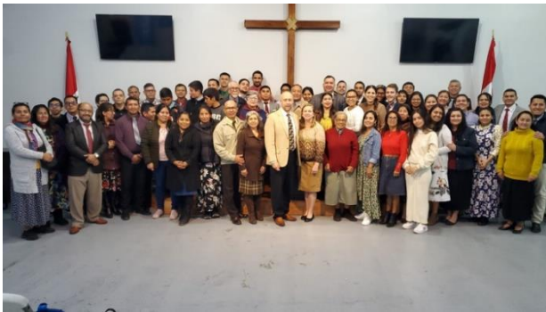
These are all those who are involved in our Bible institute this semester!