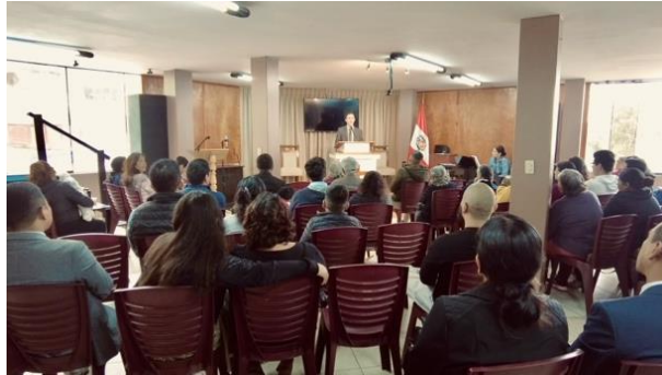
We enjoyed celebrating Family Day at our church!