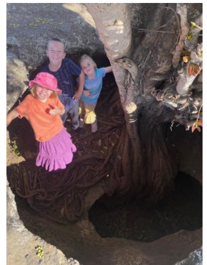
Exploring Hyena Caves!