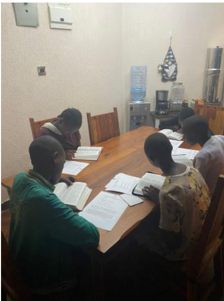
Our teens are enjoying some time in the Word of God!