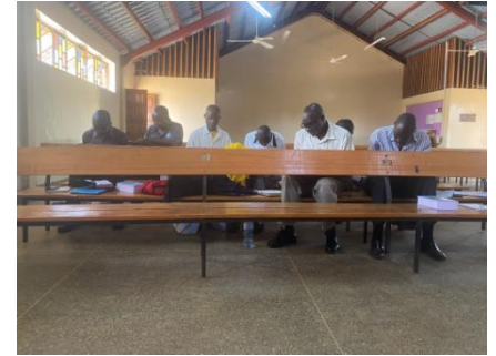
PPTA week—teaching the pastors