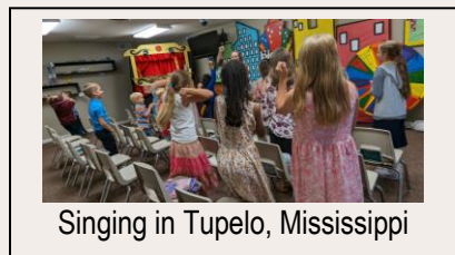
Singing in Tupelo, Mississippi

in chapel and answered fun questions in their classes. It was a joy to talk with the Junior Church and Kidz Club about missions in Ghana on the 17 th . In the morning, I shared my video presentation with the adults in Charlottesville, Virginia. It was great to share my presentation during prayer meeting in Danville, Virginia. On August 24, I had the joy of teaching the beginner class about missions in Flintstone, Georgia. In the evening, I shared with the congregation about the ministry in Ghana. I closed September by visiting family friends and a college friend in Virginia and Georgia.