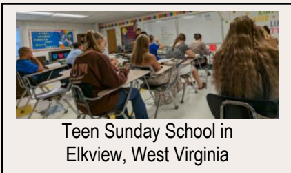
Teen Sunday School in Elkview, West Virginia

On September 3, I started in Appomattox, Virginia, where I shared my presentation with the adults in the evening. It was great to hear the many missions questions from their Junior Church and Truth & Training-Awana class. In Fairmount, Georgia, it was great to share my testimony and video with the folks at prayer meeting. On September 10, I had the privilege to share my testimony with the teens in Sunday school and talk with the Junior Church about missions. On Sunday evening, I shared about the ministry in Ghana with the adults in Elkview, West Virginia. It was great to be a part of the Missions Conference in Tupelo, Mississippi, talking with the children and adults. We missionaries talked with their Christian school students