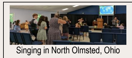
Singing in North Olmsted, Ohio

It was great to see prayer warriors in Trumansburg, New York, and Roaring Spring, Pennsylvania, at the beginning of August. On August 13, I had the opportunity to speak with the members in Indian Lake, New York, about the ministry in Ghana. In North Olmsted, Ohio, on the 20 th , I had the privilege of sharing my testimony in Sunday school and my presentation with the congregation. I also spoke with their Junior Church about missions. I talked with the teen classes and members about the ministry in Ghana on August 27 in Marion, Ohio.