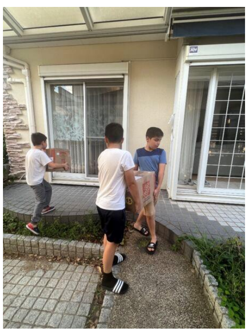
The boys are unloading our boxes that arrived from the U.S.