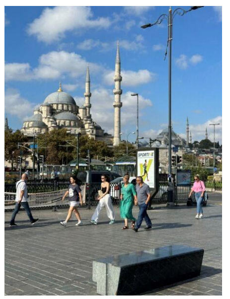
Muslims need Jesus as well!