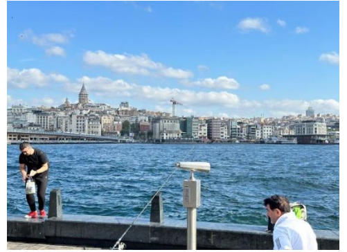
Istanbul, Turkey, where Jesus is so desperately needed!