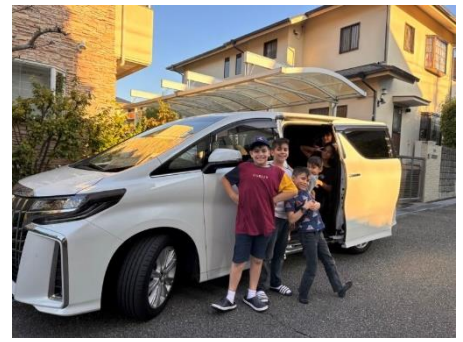
Praising the Lord for our car!