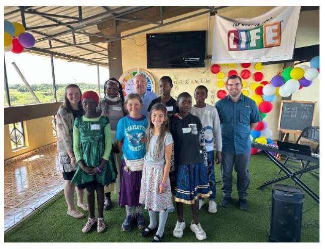
Our teens at the Teen Conference at Calvary Baptist Church of Kiambu, Kenya!