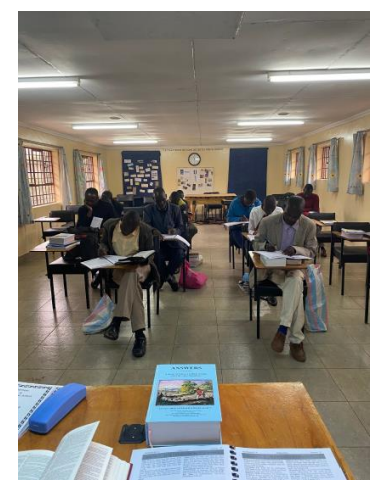
Pastors' Practical Training Academy (PPTA)