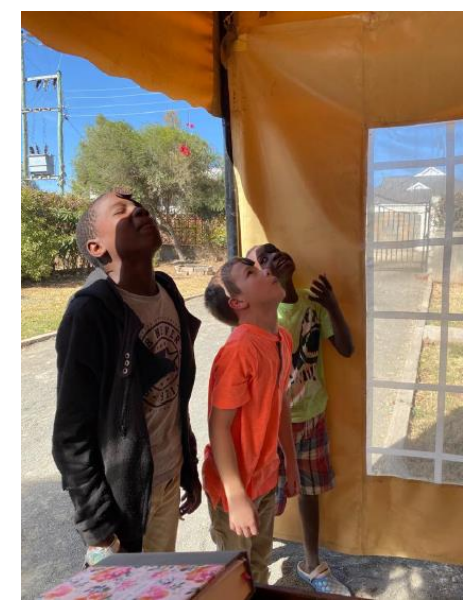
The boys playing the Oreo Game during kids' class