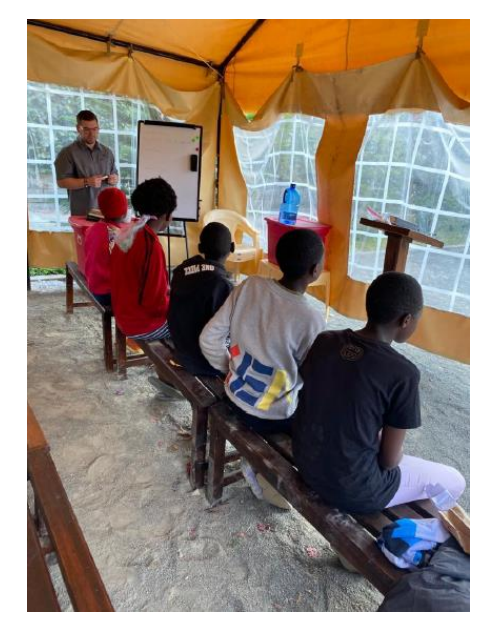
I am witnessing to our teenagers. Praise the Lord, they all came to put their trust in Christ alone!