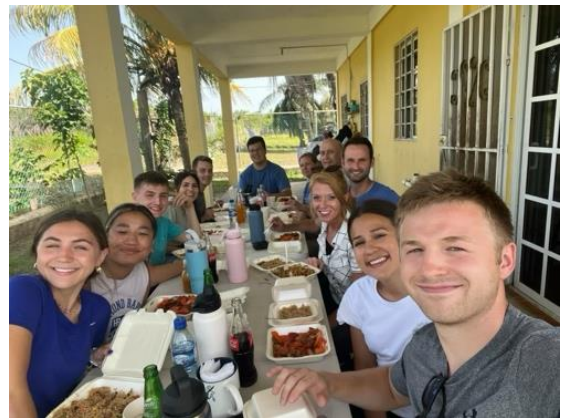
We were grateful to serve with many friends in Belize.