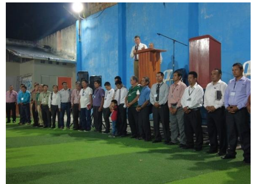
These pastors came to the conference in Iquitos!