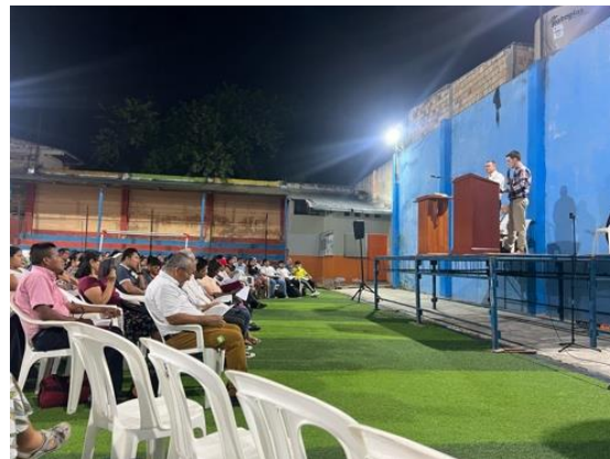
The Lord did a great work in Iquitos!