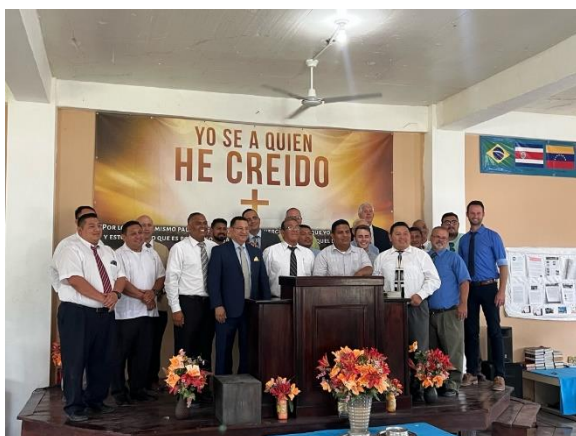
These pastors came to the conference in Belize!