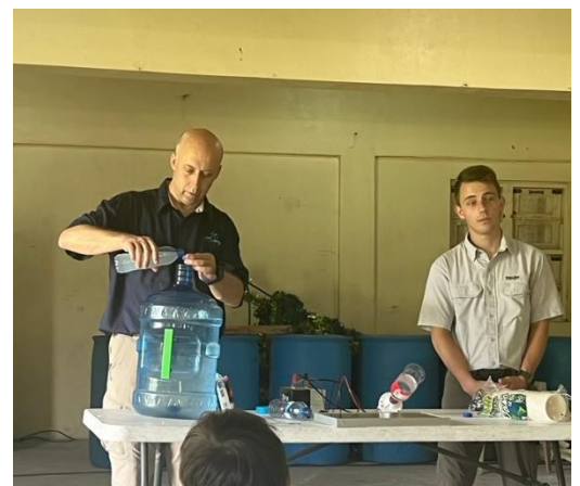
My dad and I were grateful to give a water system and a Gospel presentation in Belize.