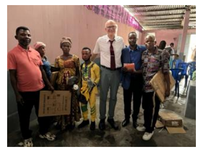
Some of the village representatives who came to get their water-purification systems

plane. Batteries and solar panels were bought in country. A complete system was going to be taught and given away to representatives from 25 villages after the morning church service. I hardly digested this news before the service. I read from I Corinthians 2:1-4 on Sunday morning during the church service. I did not go there with gifts of wisdom or excellent speech but with the Gospel of Jesus Christ and a demonstration of His love—the water-purification systems.