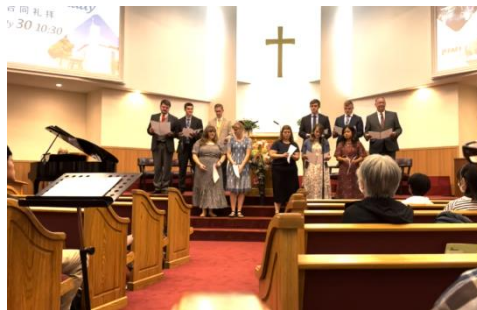
BIMI Connect missions group at Senri Newtown Baptist Church in Osaka