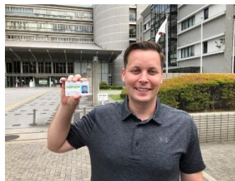
I got my Japanese driver's license!