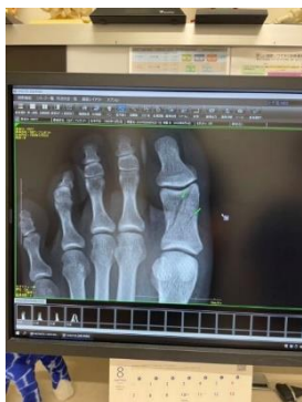
My (Brendan) broken toe