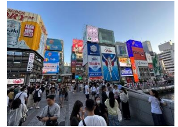
Dotonburi Street—a very busy spot in Downtown Osaka