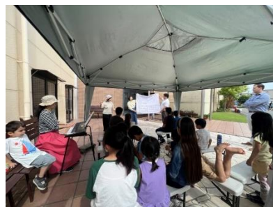
Hosannah Kids' program at Senri Newtown Baptist Church, Osaka