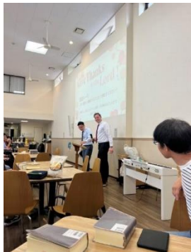
Helping with the games for the 20- to 50-year-olds' fellowship