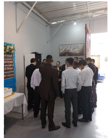
Surco men in the "ushers' huddle"