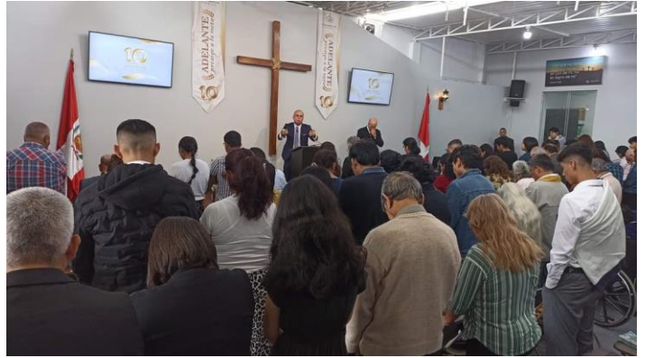
10 th Anniversary Celebration at the church in Surco, Lima, Peru!