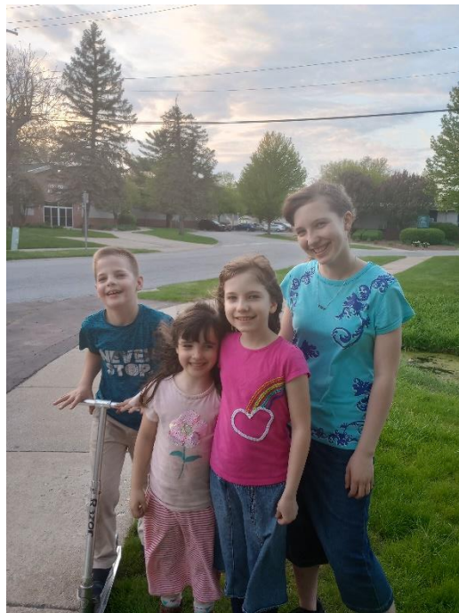
The children have enjoyed friendships with other missionary children