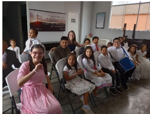
Children's class at the 10 th Anniversary Celebration in Surco!