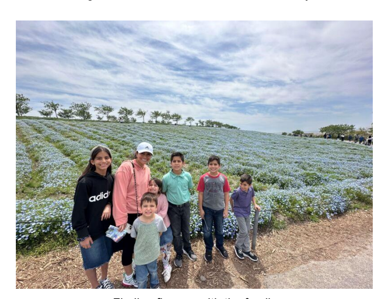
Finding flowers with the family