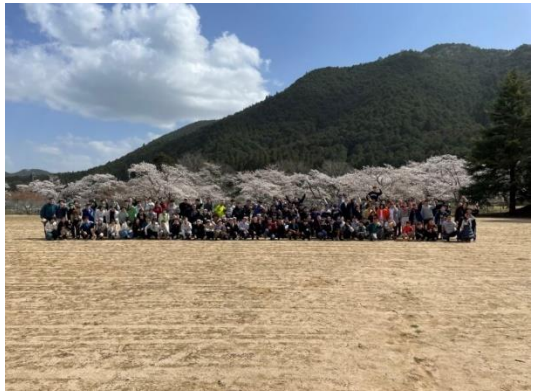
Group picture during the games at Youth Camp