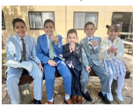
Kids enjoying Resurrection Sunday