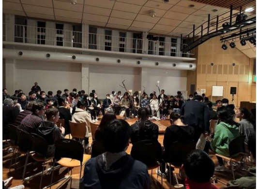
Candlelight Service at Youth Camp