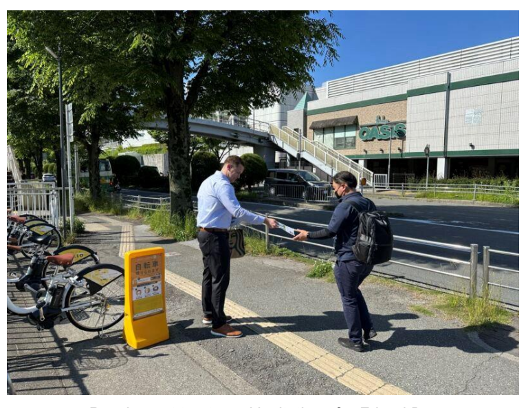
Passing out tracts and invitations for Friend Day