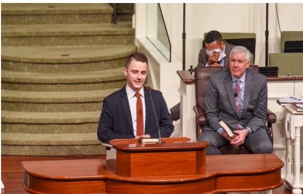
I was grateful to be able to give my testimony at my ordination service at my home church, First Baptist Church of Hammond, Indiana.