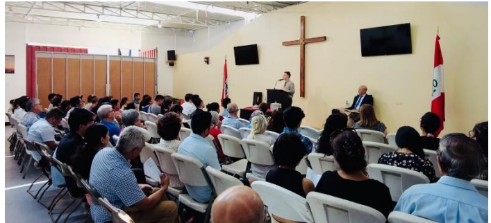
I am preaching at our church in Surco, Lima, Peru.