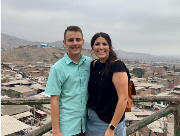
There are over 11 million people here in Peru— so much work to do!