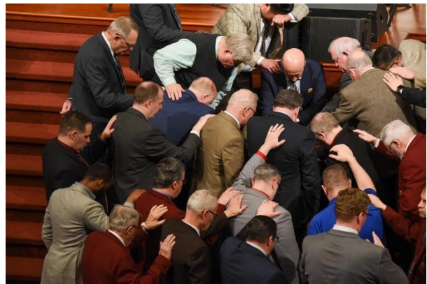
It was amazing to be able to pray with these men of our church, including my dad, at my ordination service.