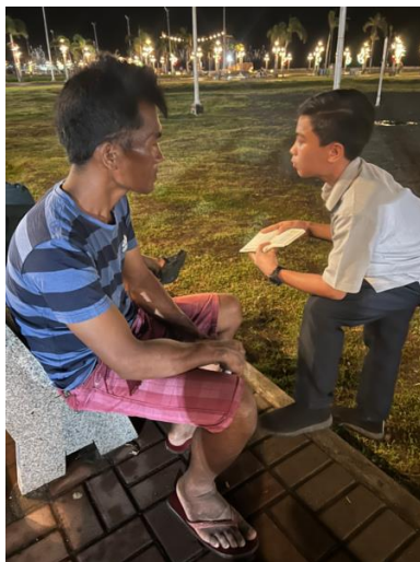
Soul Winning—one of my Thursday evening soul-winning partners leads a couple to Christ.