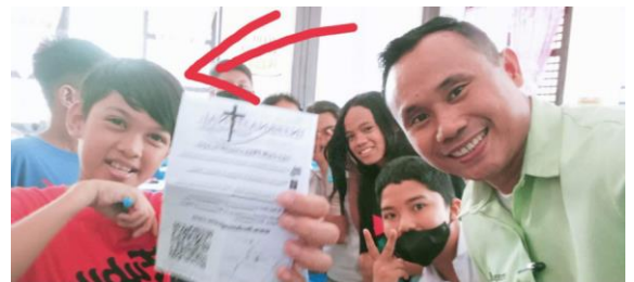
School Ministry--this young man had one of our tracts already and wants to visit.