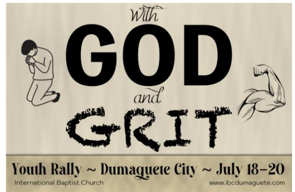
With God and Grit--pray for our upcoming Youth Rally.