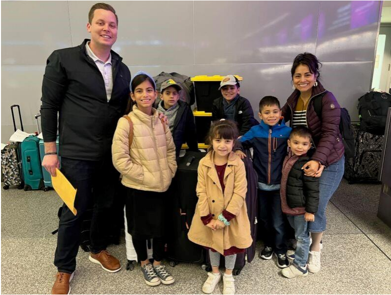
Checking all of our luggage at the San Francisco Airport