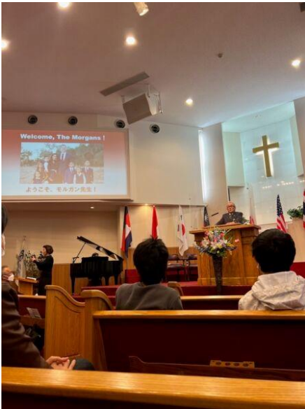
Senri Newtown Baptist Church, Minoo, Osaka, Japan