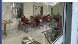
The teen service