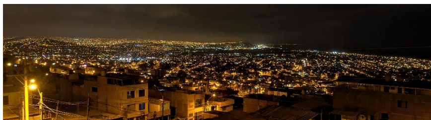
Our Little Corner of the World