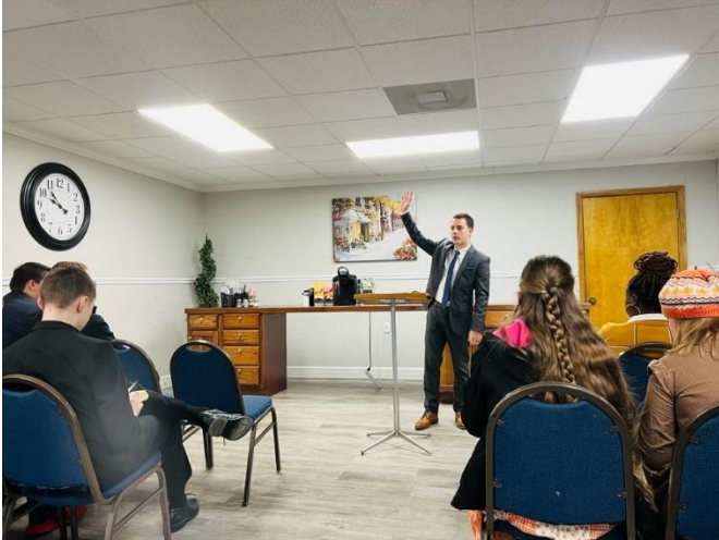
I am preaching to the teenagers at Heritage Baptist Church in Lawrence, Kansas.