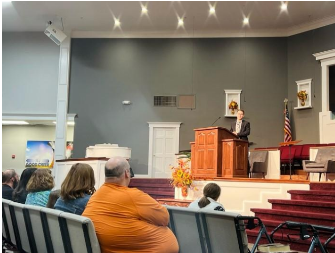
It was a joy to preach during the Missions Conference at Gospel Light Baptist Church of Malvern, Arkansas.