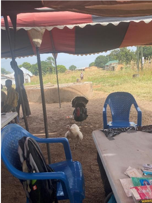
Being attacked by our next patient (maybe even our Thanksgiving dinner!)