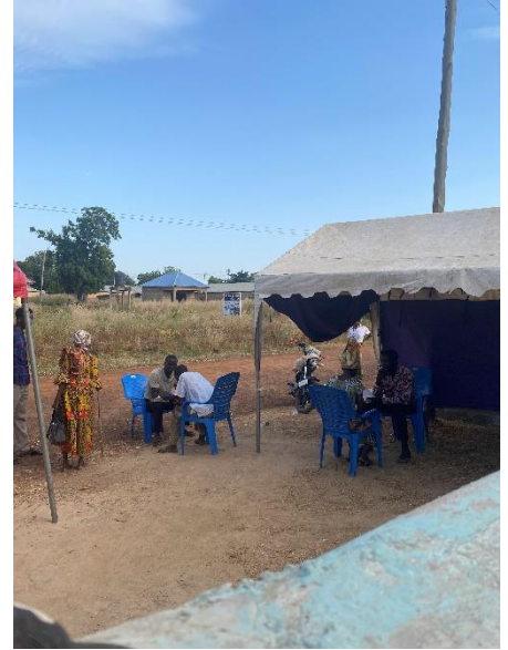
Soul winners giving the Gospel to those who came through the clinic