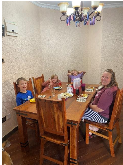
Below: Enjoying our Kenyan Thanksgiving dinner!