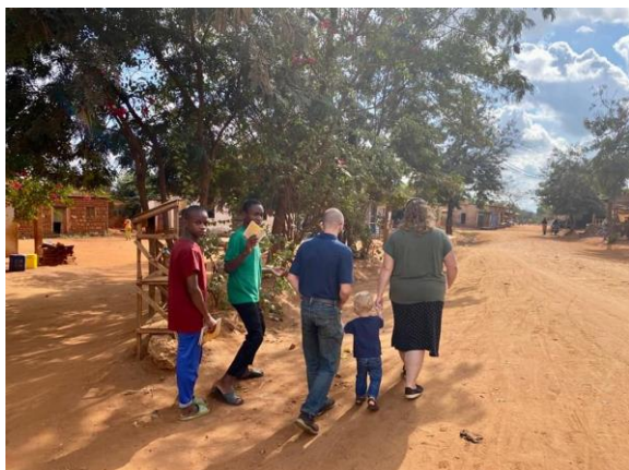
Out visiting together as a family