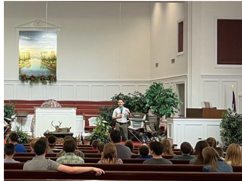
I am teaching in Vacation Bible School at Zion Hill Baptist Church.