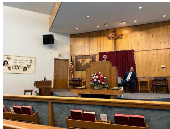
I am preaching at Whetstone Baptist Church.