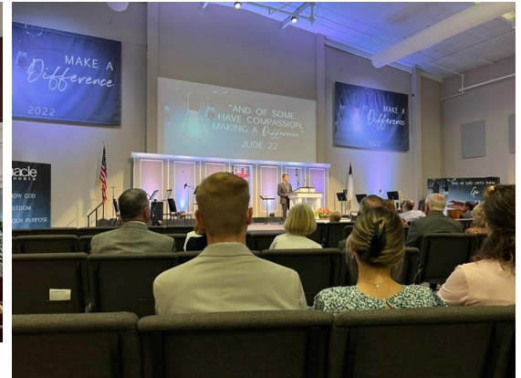
I am preaching in at Tabernacle Baptist Church.