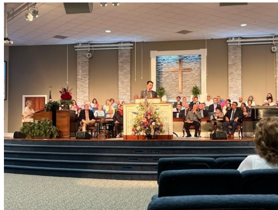
I am presenting our ministry to Woodland Baptist Church.