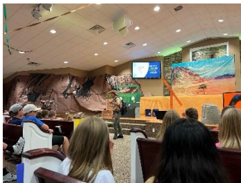
I am teaching in Vacation Bible School at Tabernacle Baptist Church.