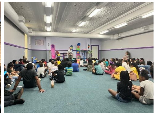
I am giving a salvation message at our home church's Vacation Bible School.