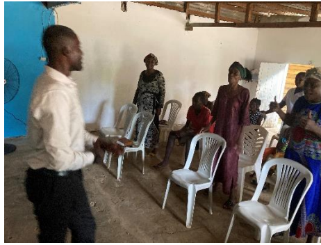
Ministry in Ntoun