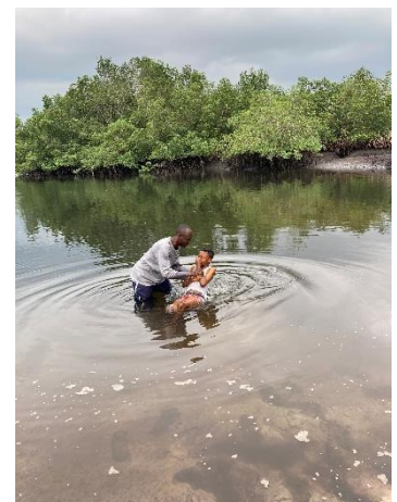
Right Prince's Baptism