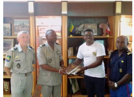
Military Scripture Distribution