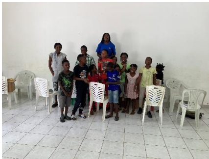
Summer School at the Church