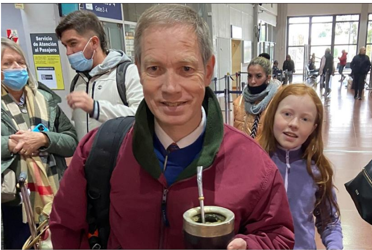
Drinking Argentinian tea at the airport