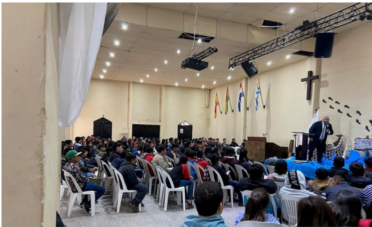
July 2022 Youth Congress at Bethel Baptist Church