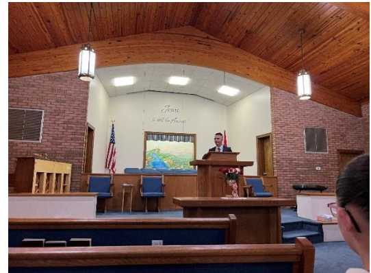
We had a wonderful time at Grace Baptist Church in Jacksonville, North Carolina.