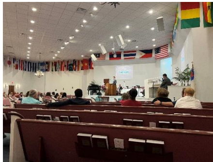
I am presenting our ministry at Calvary Baptist Church of Middleburg, Florida.