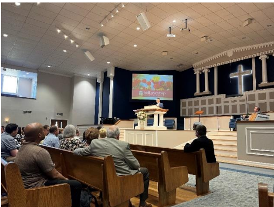
I am presenting our ministry to Fellowship Baptist Church in Durham, North, Carolina.