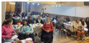
A Ladies' Meeting