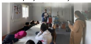
Teaching a kids' class