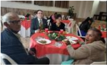
Our annual Valentine's (Couples') Banquet

We invite you to rejoice with us in the blessings of God upon our ministry. Since our last letter, hundreds have been saved in our various ministries, dozens have made a public profession of faith in Christ, and 55 people have been baptized! We thank the Lord for the faithful altar workers, soul winners, and route workers who work so hard to win the lost. Our churches are doing well, and many of our members are involved in our ministries. Praise the Lord!