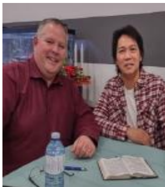
Ed got saved!