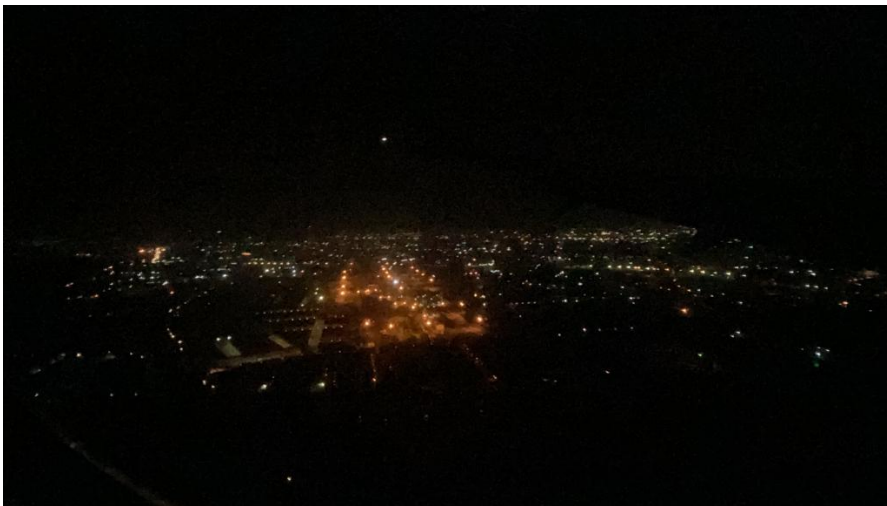
Nairobi as we are flying in