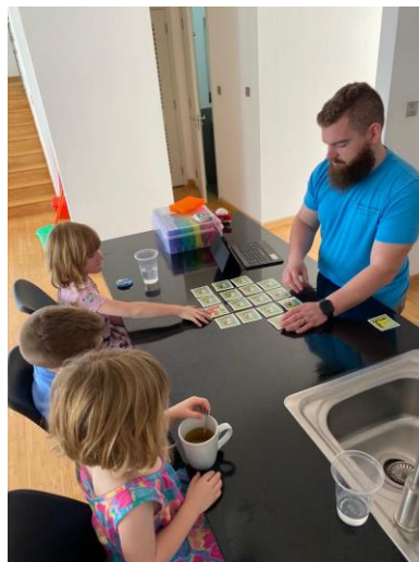
Doing family devotions to begin our day right!