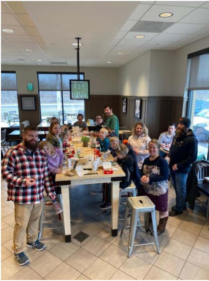
Having some family fun at Chick-fil-A