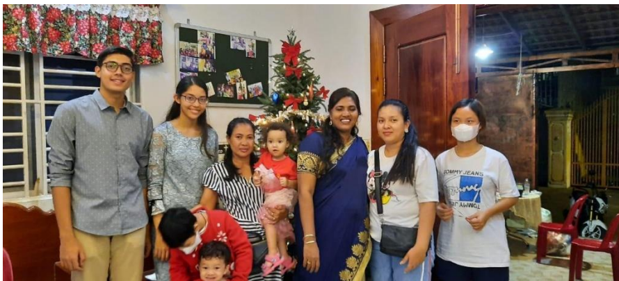
My wife with our children, along with a new convert (lady holding the baby), and various relatives