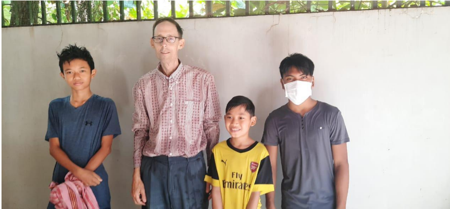
Three recent baptisms