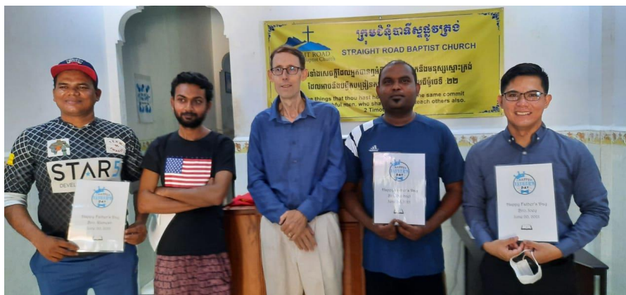
Three Pakistani men, along with Bro. Bustamante and me, on Father's Day