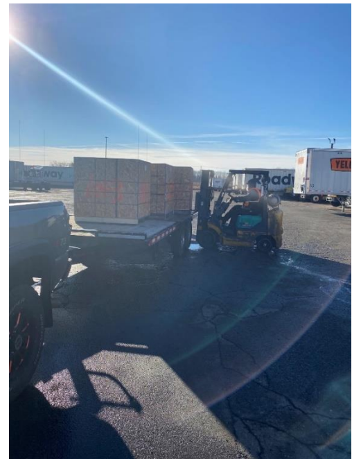
Our three crates being dropped off to be shipped out to Kenya— see you again come April!