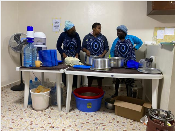
Above: The cooking team discussing the menu and what time dinner is to be served Below: Level 2 graduates from the "car park" discipleship class