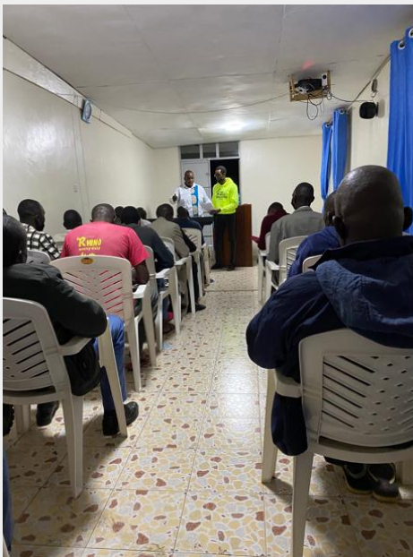
Music classes on hymns and spiritual songs