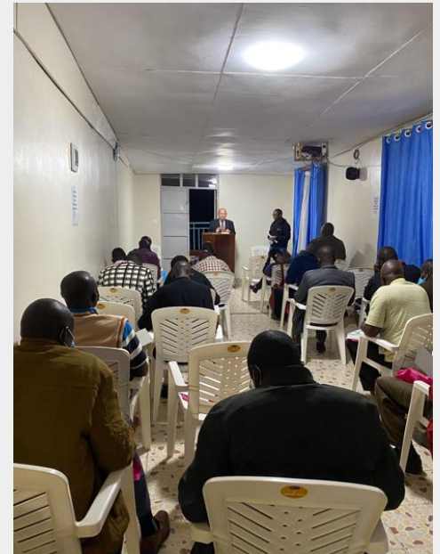
Teaching a class at the Pastors’ Practical Training Academy