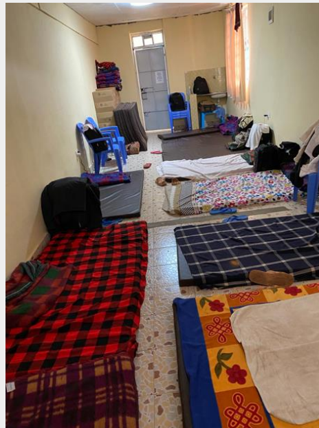
Clean accommodations for 20 pastors