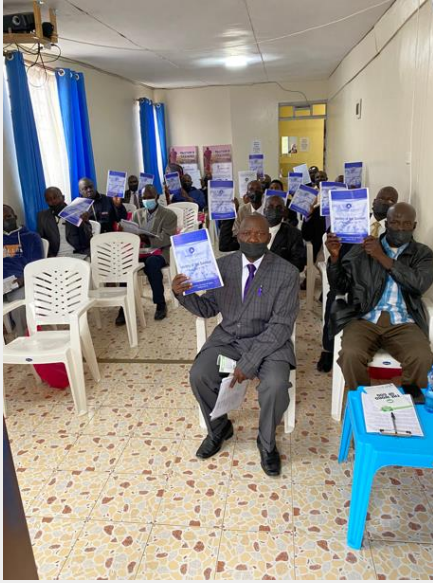
Learning from "Teaching All Nations"